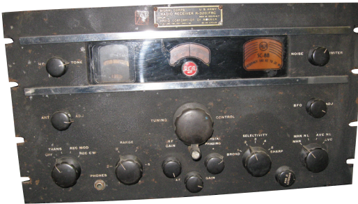
RCA Model SC88 Receiver – US Army Signal Corps R-320/FRC. Roy Nester, Tallahassee, FL.