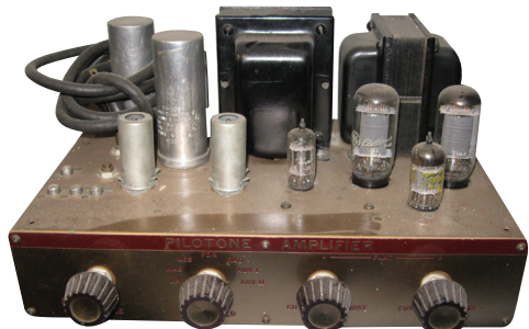
Pilotone Model AA903 – This is an audio amplifier. Uses 2 6V6 output tubes. Runs approximately 15 watts output. Chris Ponce, Austin, TX.